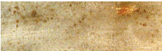
Figure B Sheltered Type 304 stainless steel components like this light pole will corrode in most coastal applications unless they are cleaned frequently. Monthly cleaning may be necessary.

In comparison, Figure B shows a close-up of a sheltered exterior light fixture support made of Type 304 (UNS S30400, EN 1.4301, SUS 304) stainless steel, which does not contain molybdenum. It is a few blocks from the ocean in Miami Beach, Florida, USA. The surface finish was applied by abrasive blasting a rough mill plate, producing a surface roughness greater than R_a 1 \mu\text{m} or 40 \mu\text{in} . The light fixture is not manually cleaned and its sheltered location prevents effective natural rain cleaning. After only one year, pitting and discoloration caused by coastal salt (chloride) corrosion are visible.