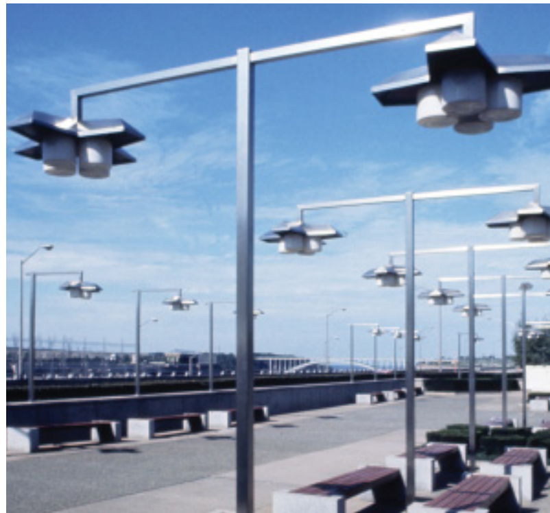
Figure A Boldly exposed Type 316 stainless steel light poles with a smooth finish provide good performance in most coastal applications.

The Type 316 sample has a few superficial corrosion spots that could easily be removed by cleaning but it still looks attractive. The Type 304 sample is badly stained. Like the two light poles, these samples illustrate Type 316's superior resistance to staining and corrosion in a coastal location.