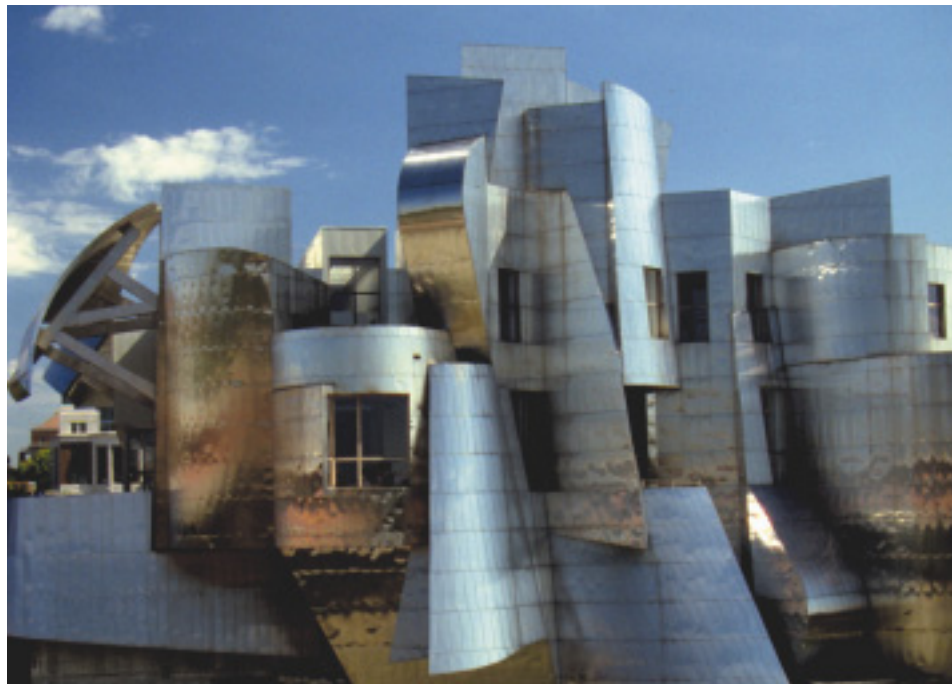
Figure A (above) Type 316 stainless steel with a smooth surface finish and a design that encourages rain cleaning was the right choice for the Weissman Art Museum. Although it is beside a busy road where deicing salt is used, there is no corrosion. The color of the building changes constantly as it reflects the surrounding environment.

The closest panels are about 4.6 meter (15 feet) from the road. A smooth No. 4 finish was specified with an average surface roughness of R_a 0.5 \mu\text{m} or 20 \mu\text{in} . During design, it was assumed that there would be little or no manual cleaning of the building. The building is cleaned about every five years to remove dirt accumulation. The design, smooth surface finish, and vertical finish grain orientation make it easy for natural rain-washing to remove salt.