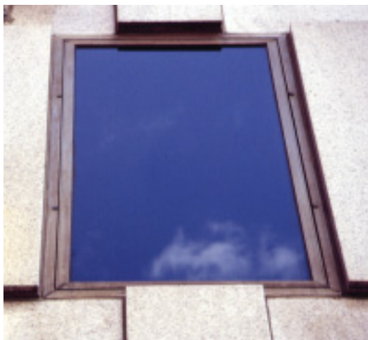
Figure C This Type 304 stainless steel window frame has not been cleaned in five years. Type 304 that is exposed to deicing salt must be cleaned regularly to remove corrosive deposits. Even with that precaution, some staining may occur between cleanings.

The Type 304 (UNS S30400, EN 1.4301, SUS 304) stainless steel window frame is a few blocks away from the museum on the same busy road ( Figure C ). Both the window frame and the Weissman panel shown in Figure B have similar deicing salt exposure, are about the same distance from the road, and have smooth finishes.